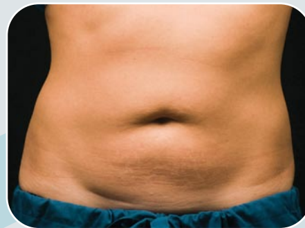
2 Months After Zeltiq Procedure