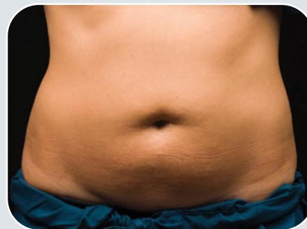
Before Zeltiq Procedure